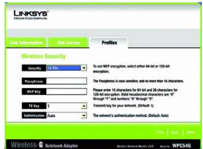
Figure 6-14: WEP Setting for New Profile

passphrase: used much like a password, a passphrase simplifies the WEP encryption process by automatically generating the WEP encryption keys for Linksys products